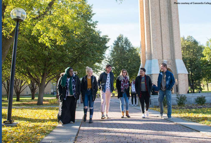
Minnesota Private Colleges